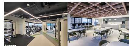
Datran Center, Miami-Dade

The new headquarters at the Datran Center is expected to attract more top talent, especially in the financial, digital, and technology sectors, further fueling Intermex's growth and innovation. With Miami rapidly emerging as a formidable financial and tech hub in the United States, Intermex is proud to reaffirm its commitment to the city, recognizing its strategic importance in our ongoing expansion and as a pivotal location for nurturing talent.